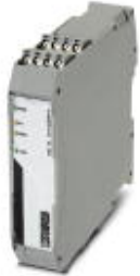
Modbus/RTU to PROFIBUS PA protocol converter

Please be informed that the data shown in this PDF Document is generated from our Online Catalog. Please find the complete data in the user's documentation. Our General Terms of Use for Downloads are valid ( http://phoenixcontact.com/download )